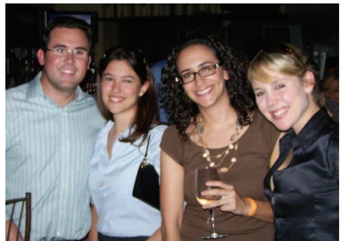
CPH's "Next Generation" council hosted a networking event this past June to promote the 2008 BlueCross BlueShield Celebrity 5K at the Regent Hotel's "Table 8" Restaurant on South Beach.